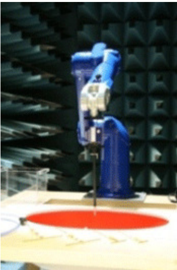
SAR Measurement system for body mounted devices