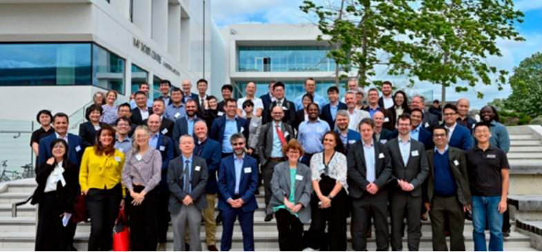
UK – Taiwan workshop 2025