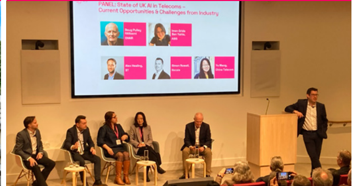
AI & Advanced Communications Conference 2026