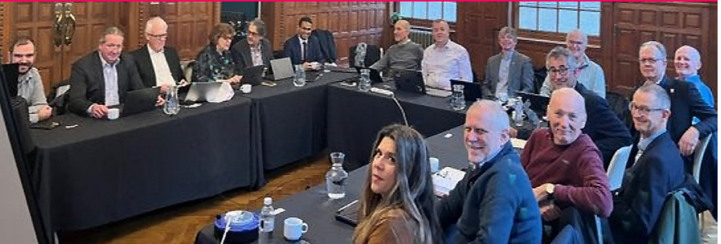
Standards Expert Working Group meeting